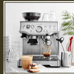
#2 Breville Espresso Machine