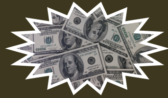
#3 $250.00 Cash