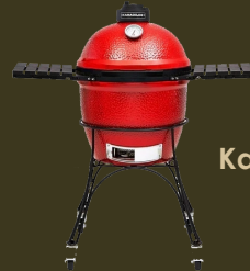
#1 Kamado Joe

RAFFLE TICKETS AVAILABLE NOW AND AT THE AUCTION, NEED NOT BE PRESENT TO WIN! General Raffle Tickets $10 each or 6/$50