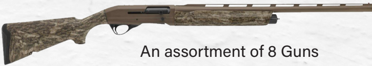
An assortment of 8 Guns

Your contributions will directly support Freedom Hills Ministries!